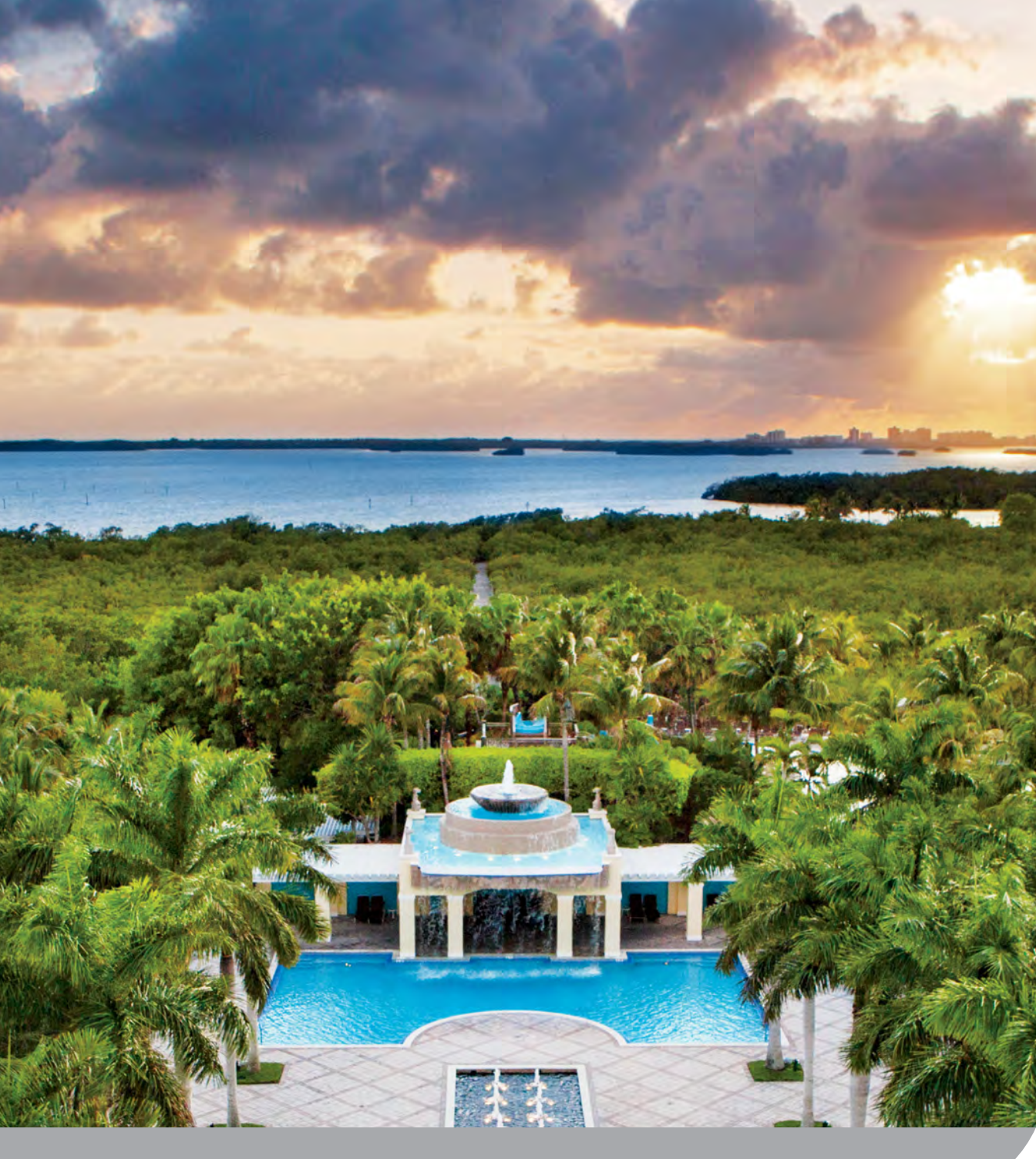
HYATT REGENCY COCONUT POINT Resort and Spa